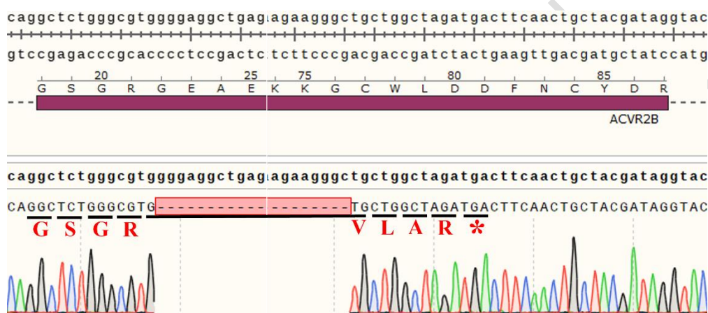
Figure 1 | The Sanger sequencing of the ACVR2B KO HEK-293 Cell Line showed successful knockout of ACVR2B.